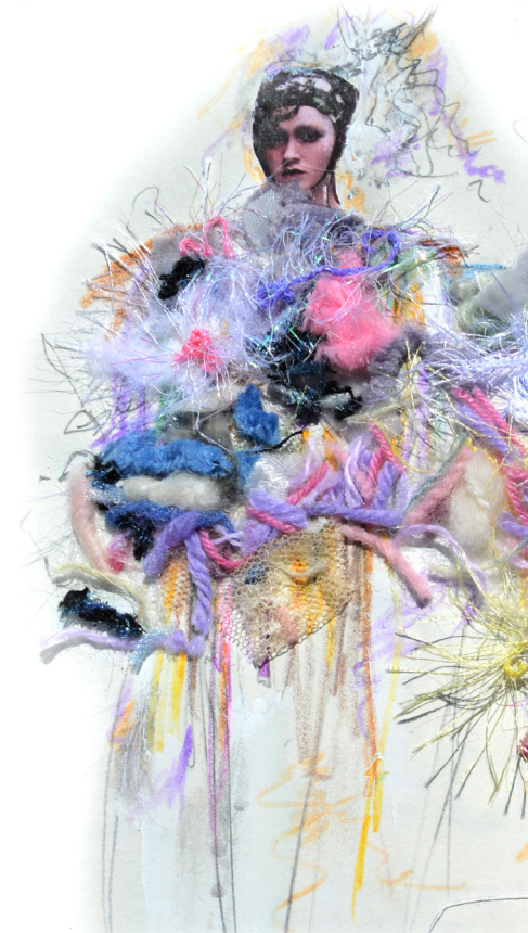
Artwork by Upper Sixth pupil Nikolina Boldero

Seats £18, floor £10 Book at www.ticketsource.co.uk/norwich-school