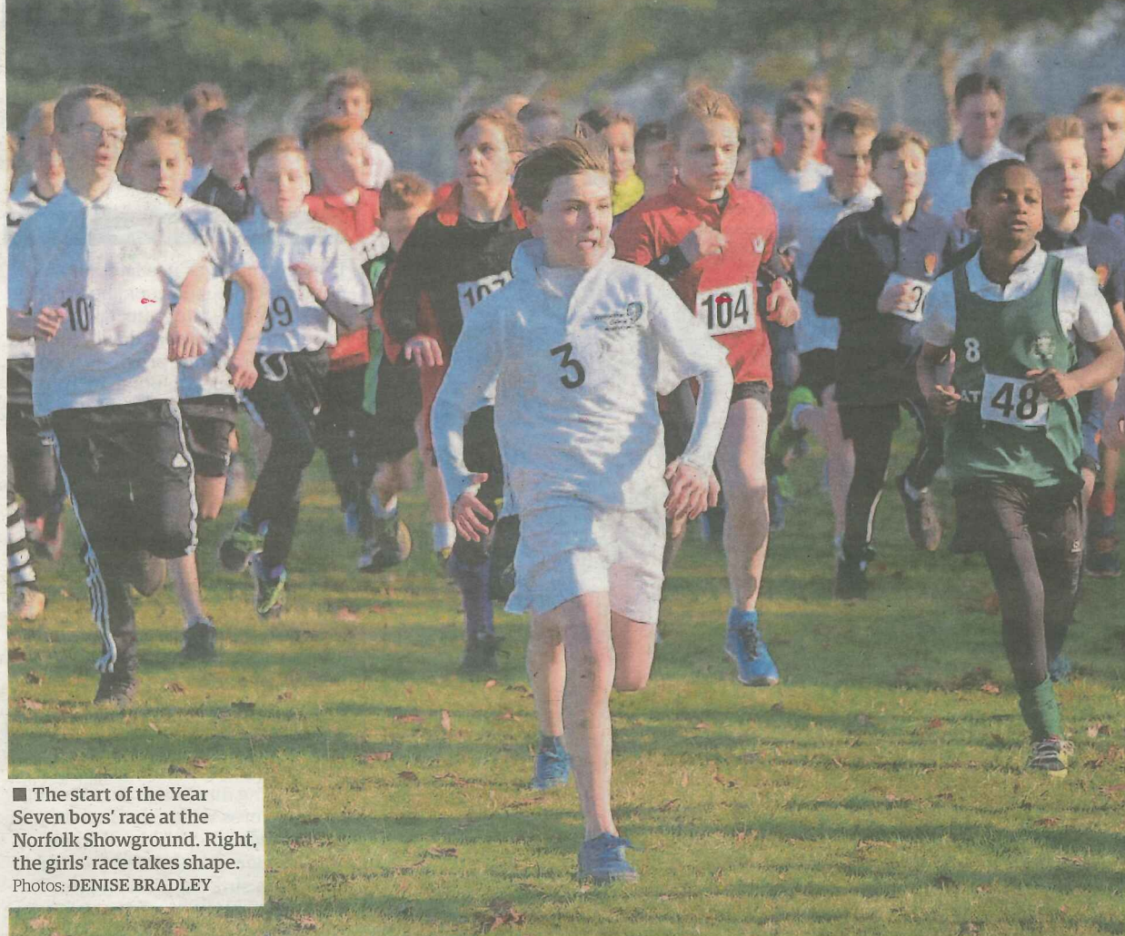
■ The start of the Year Seven boys' race at the Norfolk Showground. Right, the girls' race takes shape.