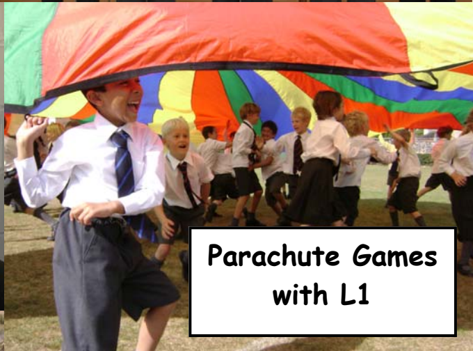
Parachute Games with L1