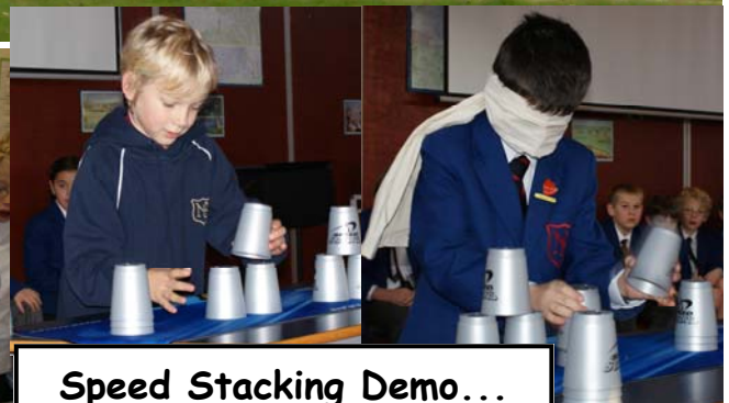
Speed Stacking Demo... The Speed Stacking Club showed off their skills in assembly