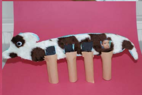
From last term: Technology Projects by Lower One B